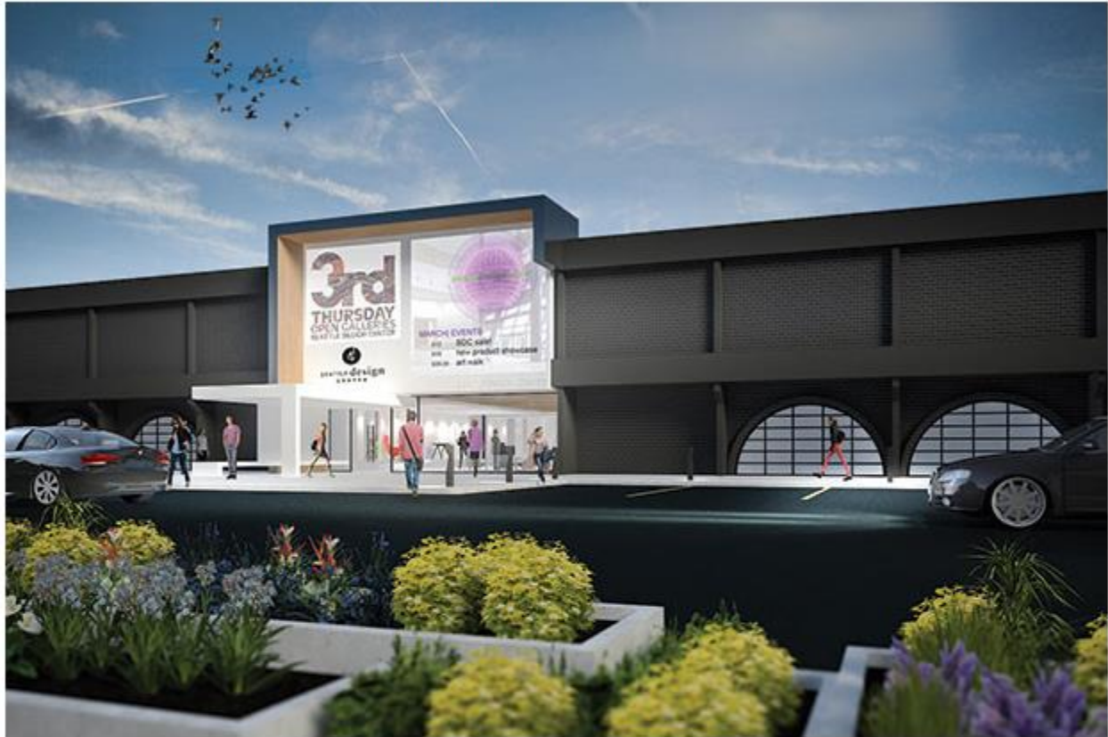
Seattle Design Center's newly renovated entrance